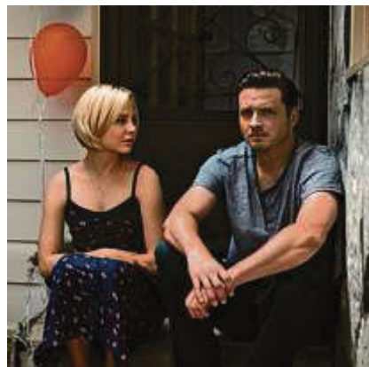
Adelaide Clemens and Aden Young in the drama series "Rectify."

serves a lot more recognition. It aired on Sundance, and it's an intimate look at a guy — played with great wounded heart by Aden Young — who has been let out of Death Row after 19 years thanks to DNA evidence. He has not been exonerated, though, and he must face wary friends and a mother (played beautifully by J. Cameron Smith from "Succession") whose buried ambivalence is excruciating. The action moves slowly, in the deliberate way "Breaking Bad" did, as he faces