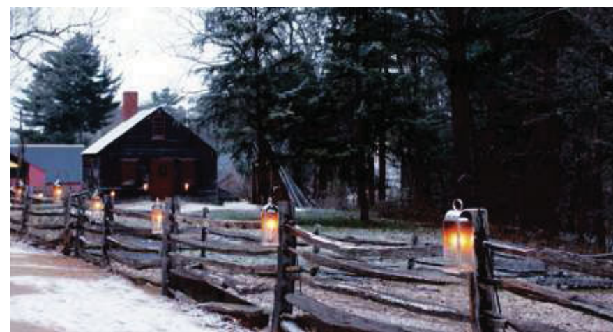
OLD STURBRIDGE VILLAGE