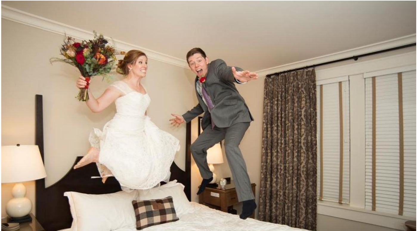
KimptonTaconicHotel inManchesterVillage,, Vt.

By Niece Regis | GLOBE CORRESPONDENT AUGUST 20, 2017