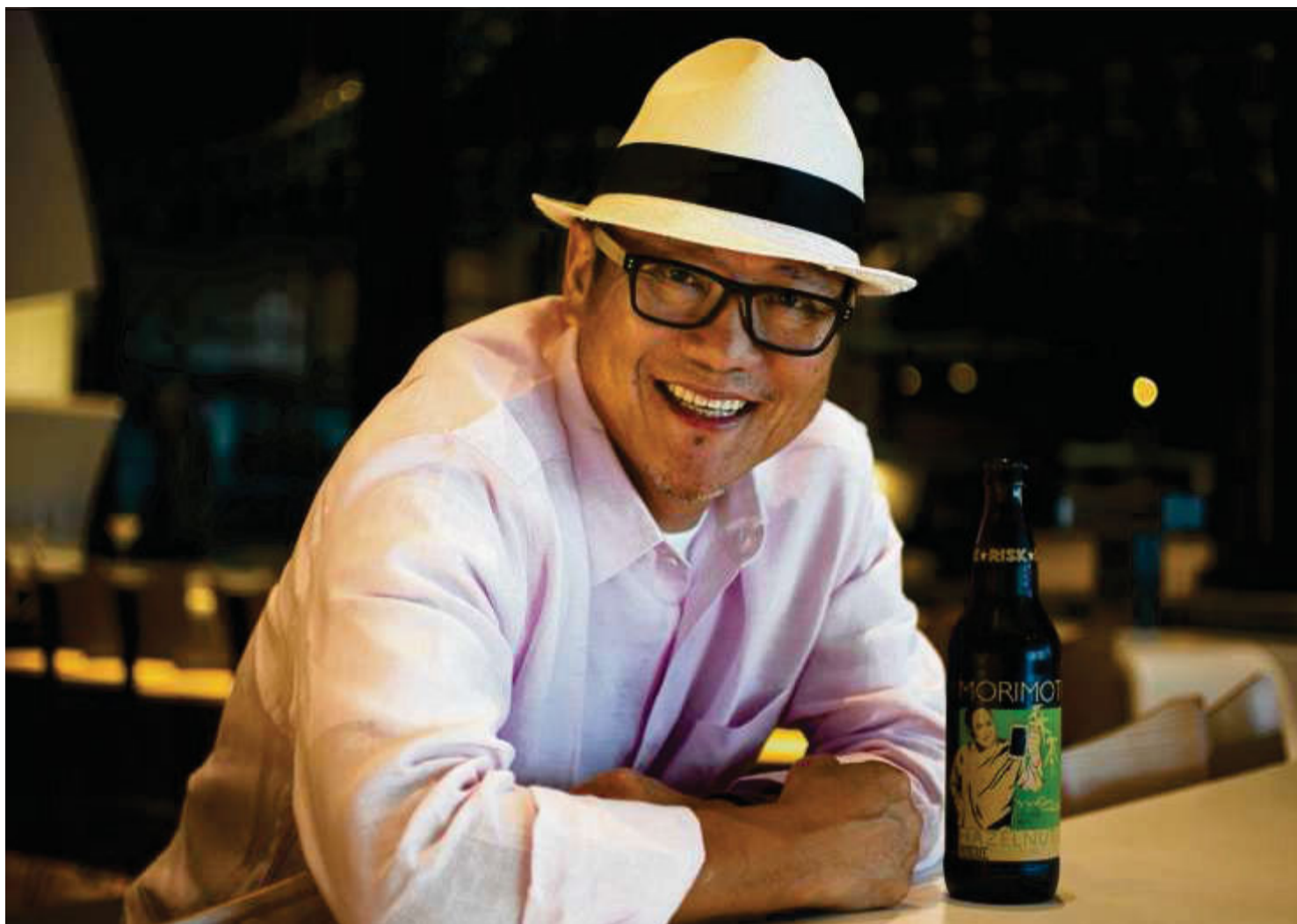
THE VIP LOUNGE | CHEF MASA HARU MORIMOTO