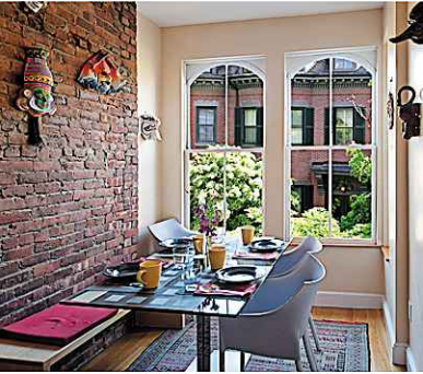
A two-bedroom suite (left) at The Porches Inn in North Adams; the breakfast nook (above) and the Bernstein room (below) at Encore in Boston’s South End. The sprawling stone and wood farmhouse of Stonover Farm in Lenox (bottom) has a view of a duck pond.