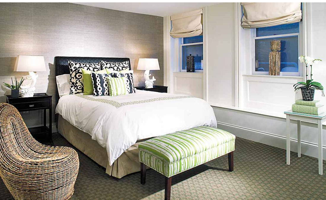
CLARENDON SQUARE INN

From top: Outermost Inn in Aquinnah on Martha's Vineyard; The Guest House at Field Farm in Williamstown; and Clarendon Square Inn in Boston's South End.