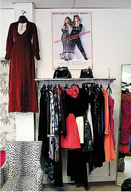
On Northampton’s Main Street, Sid Vintage sells retro-funky clothes and kitschy items.

Quirky attractions abound. Ye Ol’ Watering Hole & Beer Can Museum (287 Pleasant St., NORTHAMPTON, Page M7