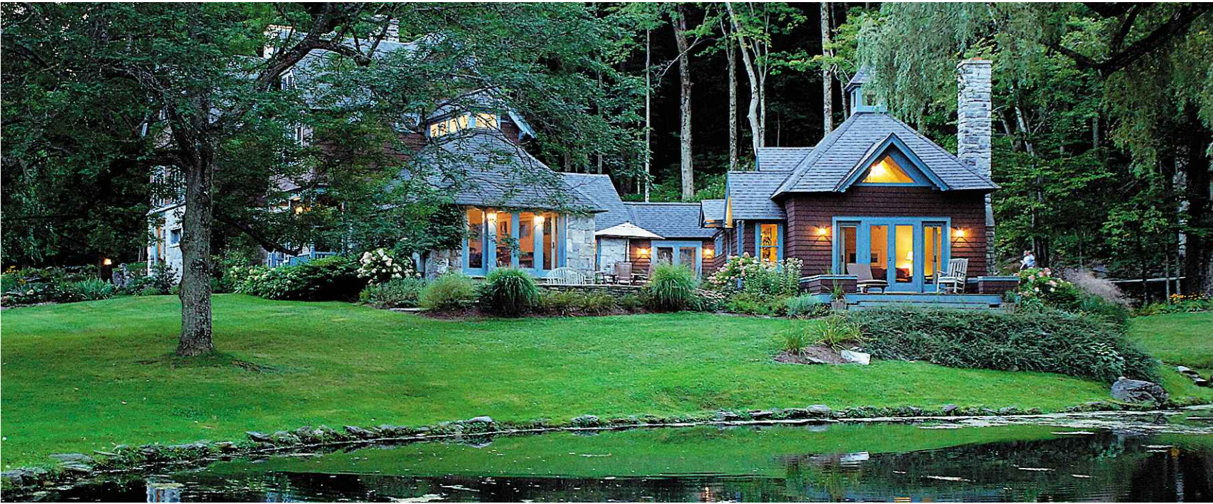
KEVIN SPRAGUE (STONOVER FARM); KRISTIAN SEPTIMUS KROGH (THE PORCHES)