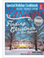
TABLE OF CONTENTS ( http://www.yankeemagazine.com/issue-archive?issue-year=&issue-month= )

There's no better time and place for swimming, sunning, sailing and happy sighs than summer in our six-state region. Here's our guide to 10 of the prettiest beaches in New England.