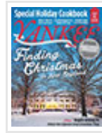
TABLE OF CONTENTS ( http://www.yankeemagazine.com/issue-archive?issue-year=&issue-month= )

Vermont recently declared itself home of the World's Best Foliage. With forest covering three-quarters of the state and the highest percentage of maple trees in the country, it's easy to see why. "No one does foliage better than Vermont," said Governor Peter Shumlin. Here are ten of the prettiest fall foliage villages in Vermont.