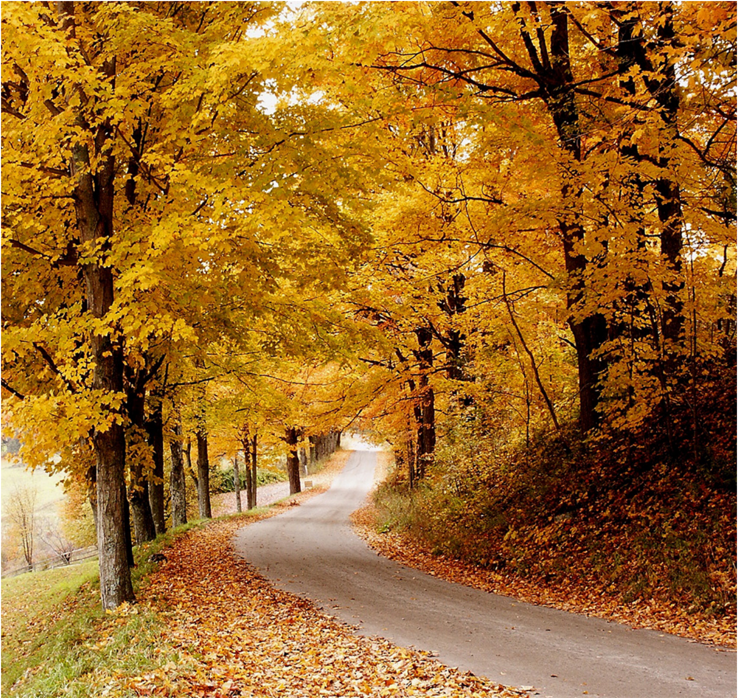
Photo/Art by Butch Lombardi ( http://eastbayimages.zenfolio.com/ )